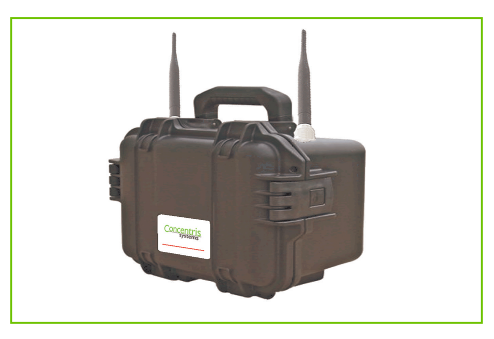
Rugged and reliable, the RL150 is the world's first fully-portable, self-powered OLSR router.

Secure and dependable - RapidLink utilizes AES-based encryption tunnels to protect the data and network from intrusion and evesdropping.